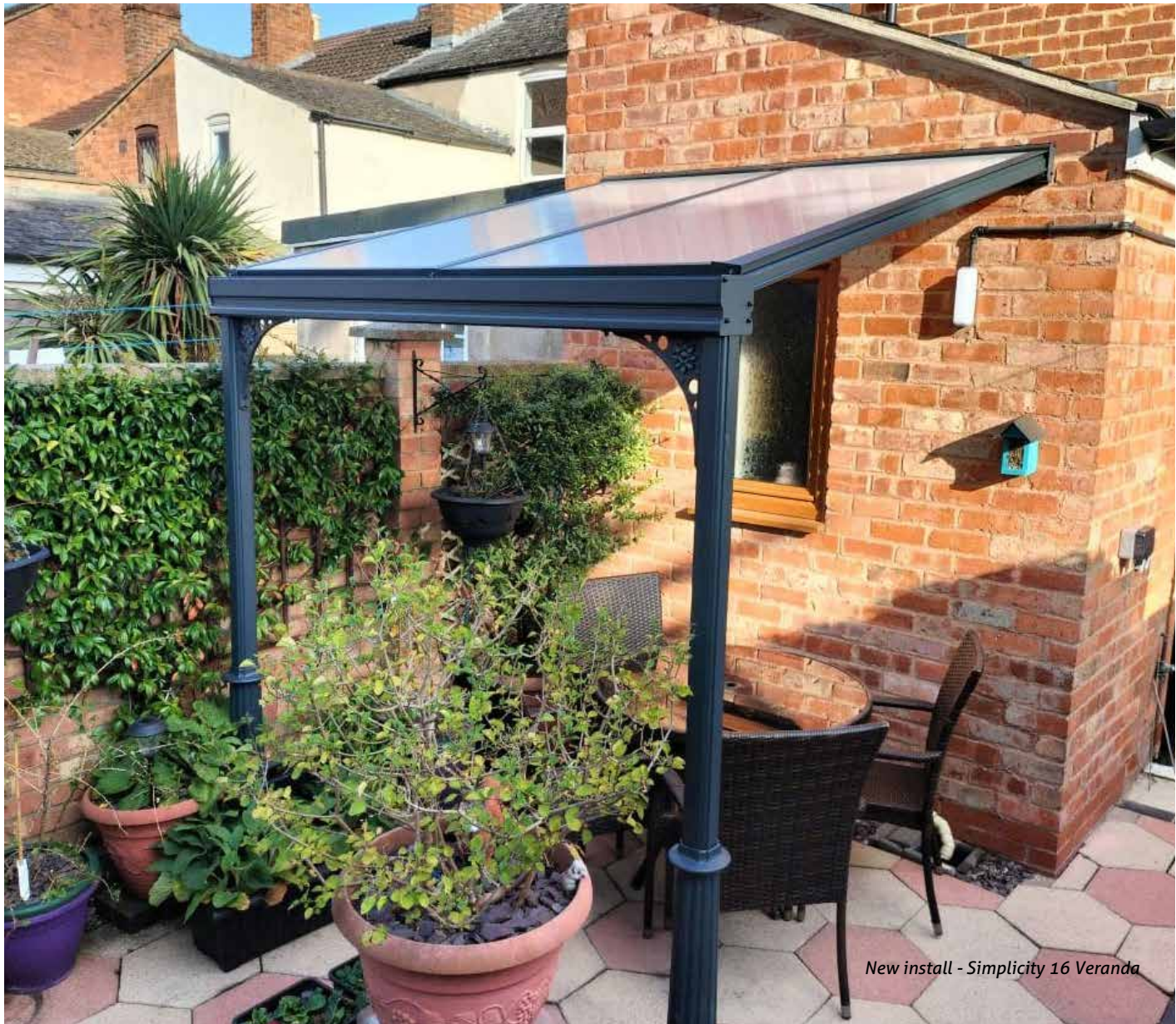
New install - Simplicity 16 Veranda