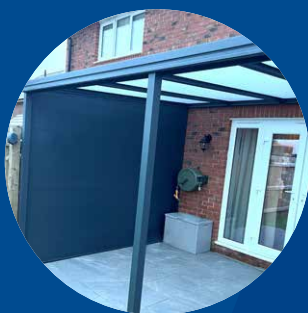
Shading & Privacy Screens