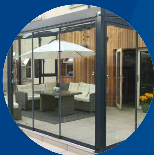
Glass Sliding Doors